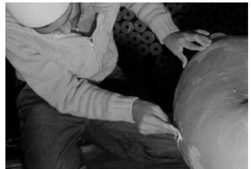
12-05-2009, prototype of BaksheeshBoy in Stuttgart