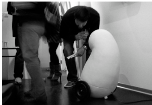
12-18-2009, our interactive robot at Creative Weekend Madrid